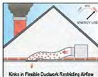
Kinks in Flexible Ductwork Restricting Airflow

PROBLEM D - "Kinks in flexible ductwork restricting airflow" SOLUTION D - FlexRIGHT*