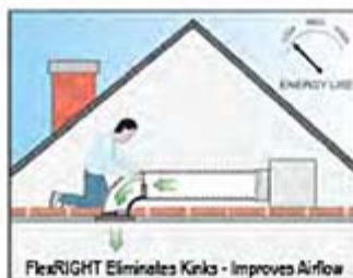
FlexRIGHT Eliminates Kinks - Improves Airflow